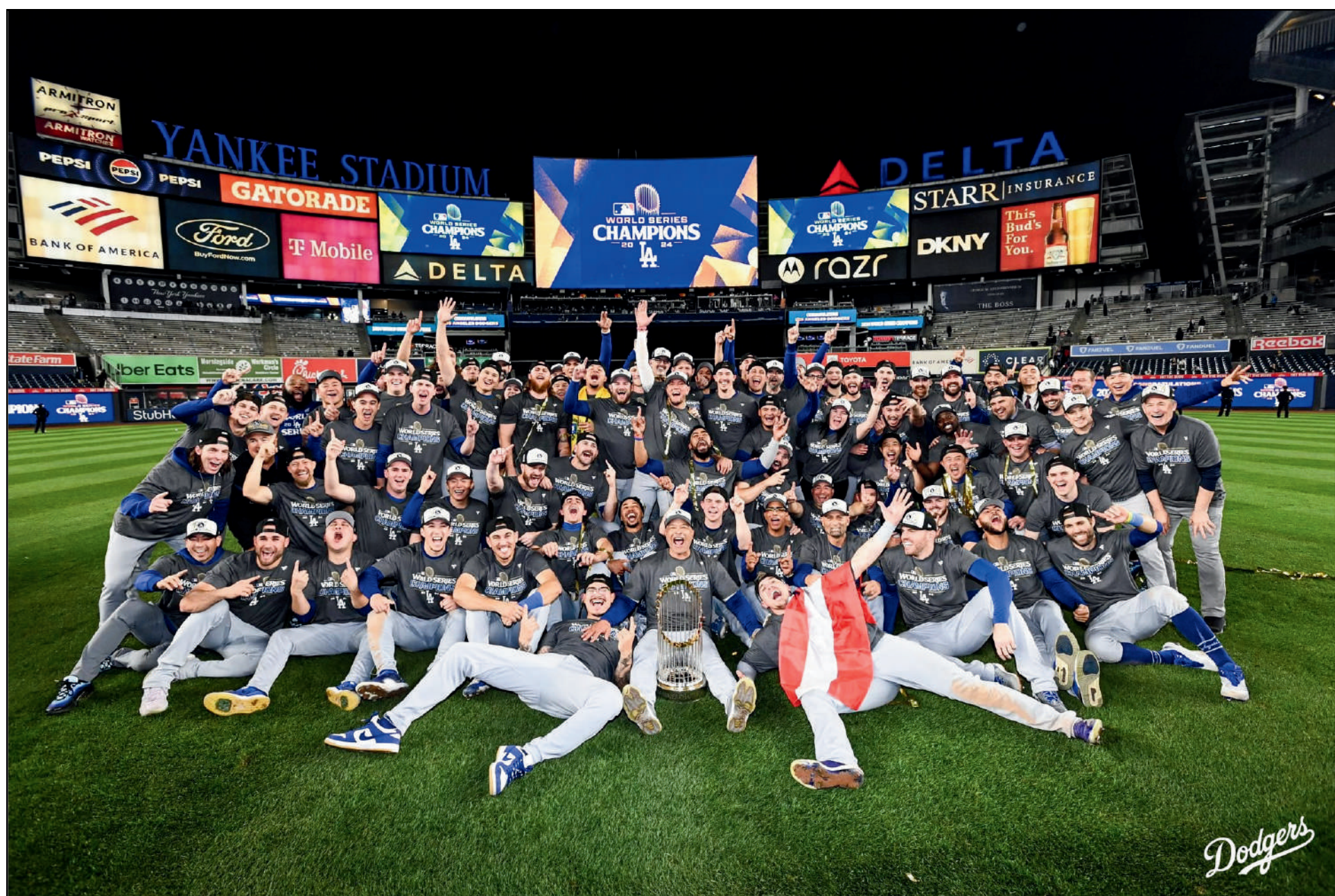
The Dodgers posing for a picture at Yankee Stadium with their trophy after defeating the New York Yankees in Game 5 Wednesday.